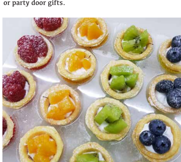
Fruits tartlets for parties and events.