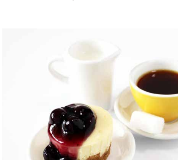
Our popular petite cheesecakes.