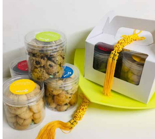
Organic Cookies made with reduced sugar and fats: Old-Fashioned Rock Buns, Double Choc Chips, Crunchy Peanut Butter and Oatmeal chippers