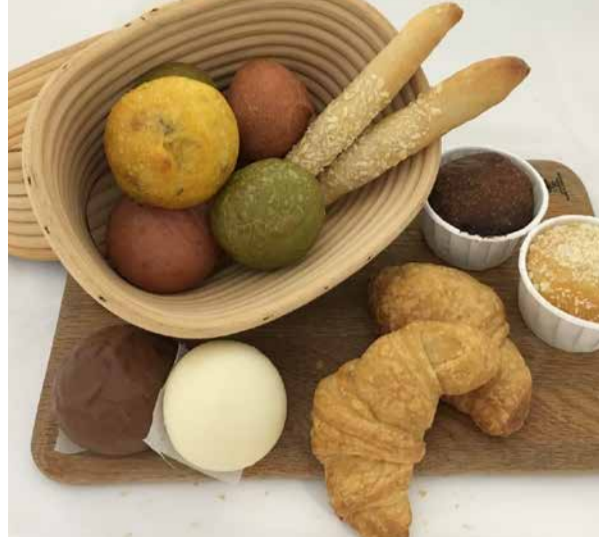
100% sourdough bread: Petite Buns, Breadsticks, Cup-Breads, Croissants and Mantous.