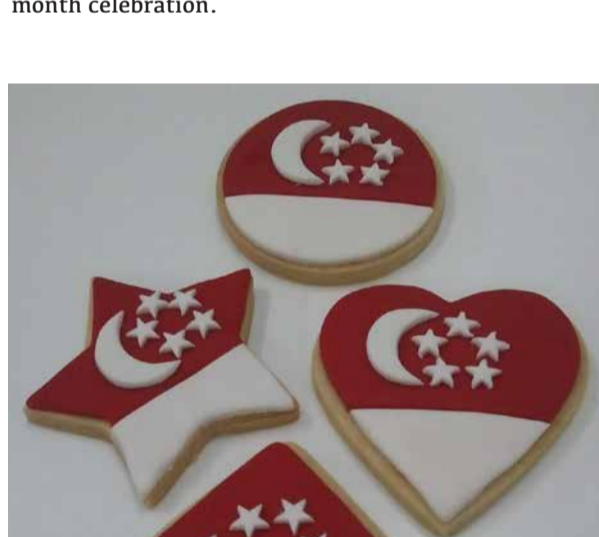
Fondant biscuits for special occasions.