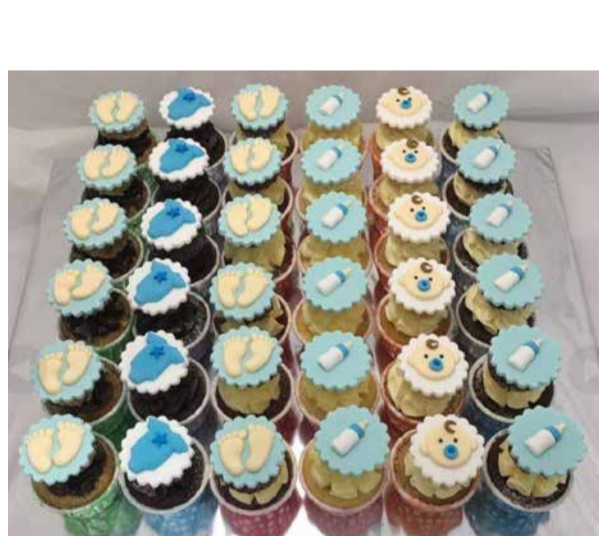
Bespokene petite fondant cupcakes for baby full month celebration.