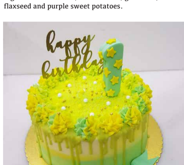
Bespokene birthday cake for all ages.