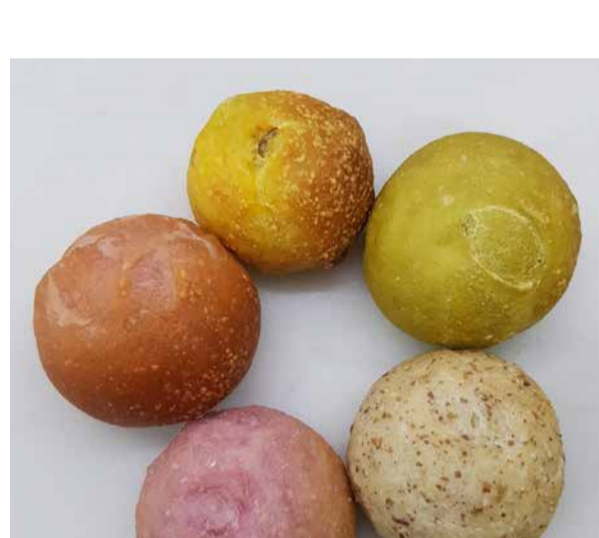
100% sourdough buns made with natural and fresh ingredients: beetroot, carrot raisin, green tea, flaxseed and purple sweet potatoes.