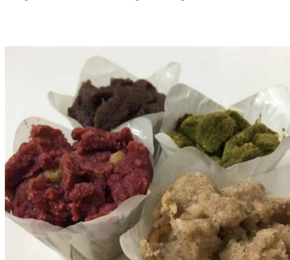
Vegan Crumbcakes: beetroot, cocoa, green tea and vanilla flavours. Great for breakfast and snacks.

Order online or drop by our Bakehouse (near Sengkang Sports Center) to share your love and bond with your loved ones