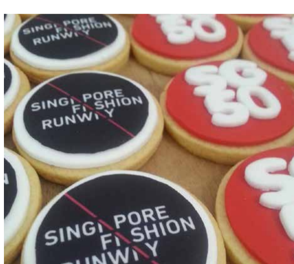
Customised tasty cookies decorated with edible photo-prints and fondant: Great as Corporate gifts or party door gifts.