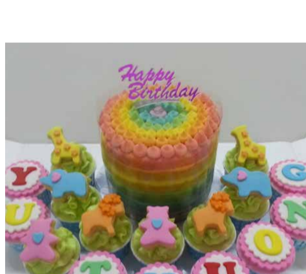
Bespokene whole cake and petite cupcakes.