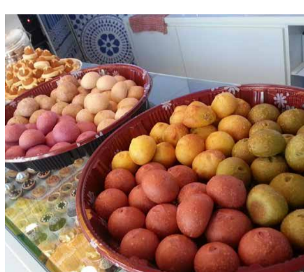
Petite Goodies that are great for all occasions.